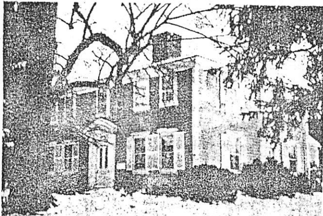
The family homestead on High St., built in 1793.

Tucked away in a far corner of Duxbury is a country road full of the charm of yesteryear, a quiet street lined with antique houses retaining the flavor of less hectic living. You will see sheep munching unhurriedly, hear a rooster crowing "good morning," smell the freshness of a meadow. High St. has that traditional New England rural atmosphere. It's no wonder that Priscilla Harris and her husband Ed decided 12 years ago to come back to the old homestead where she was born, restoring the antique house dated 1793.